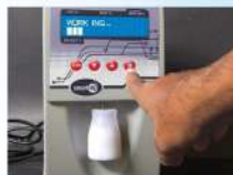
One Touch Analysis