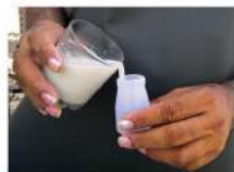
Minimal Milk Sampling

Being the manufacturer, Prompt makes spare parts easily available and offers reliable service, PAN India.