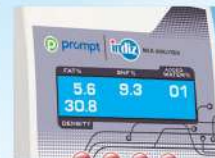
Fast and Accurate Result