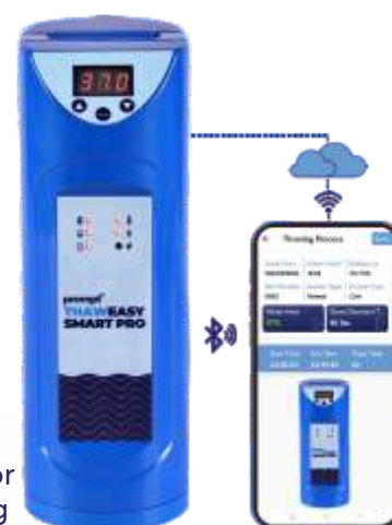
*Prompt Thaweasy Smart Semi automatic model also available