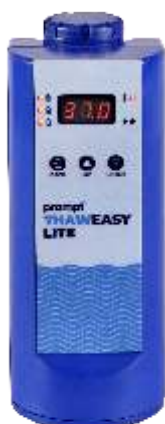
*Prompt Thaweasy Lite Plus Model with bluetooth and mobile app

A manual semen-thawing system designed to standardize and streamline semen-thawing during artificial insemination. It has manual temperature-control settings, which ensure accurate semen-thawing process that enable adherence to standard operating procedures (SOPs).