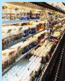
Frozen & Perishable Food Storage