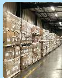
Cold Chain Logistics & Distribution Hubs