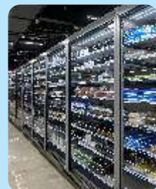
Retail & FMCG Cold Rooms